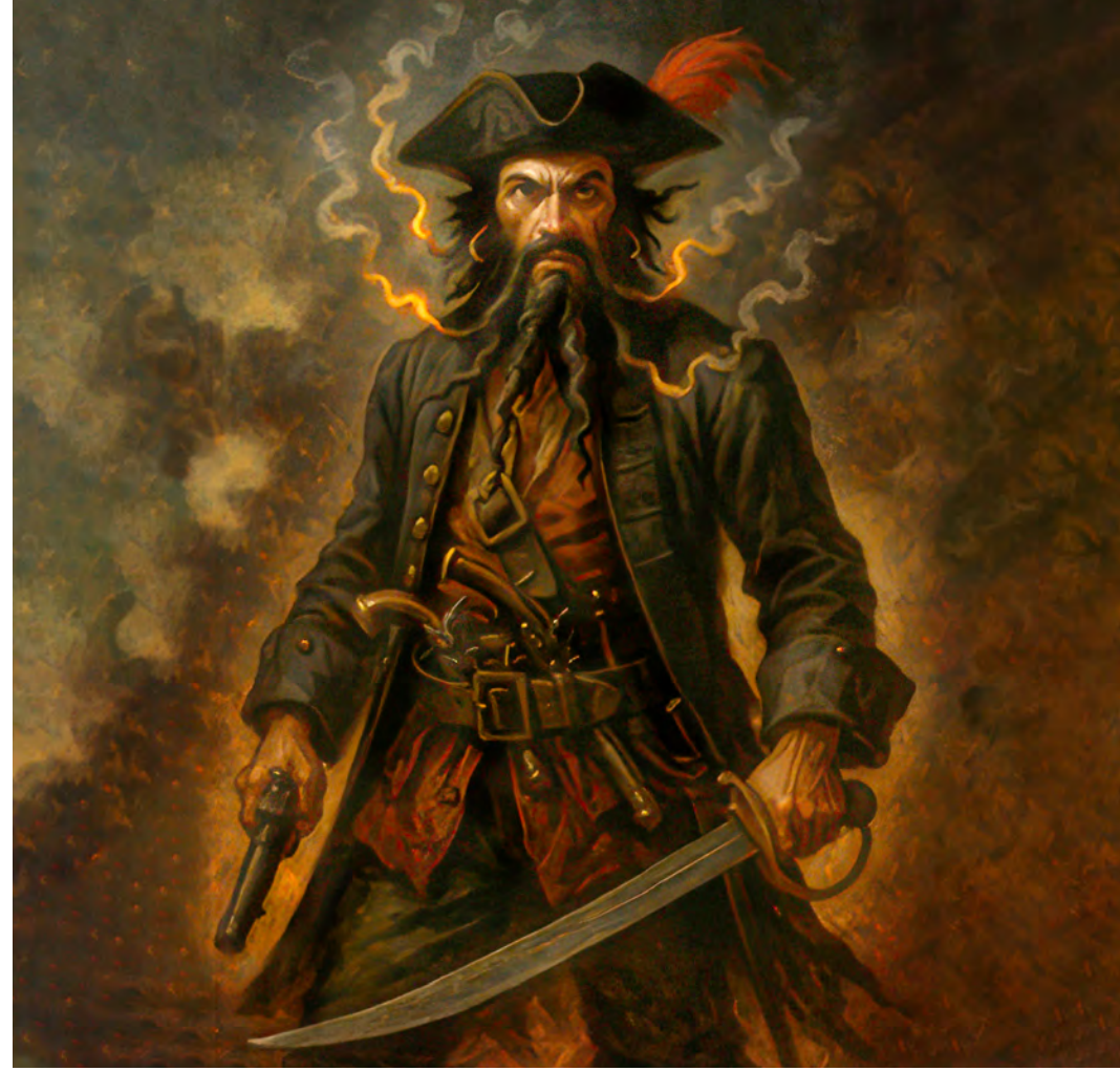
The pirate Edward Teach was known as "Blackbeard."

People were angry but helpless. Six long days went by. The government had two choices: fight the most dangerous pirate alive or give him what he wanted. They chose to give him what he wanted. Charleston officials gathered expensive medicines worth hundreds of dollars, a fortune back then. They sent it out to Blackbeard's ship.