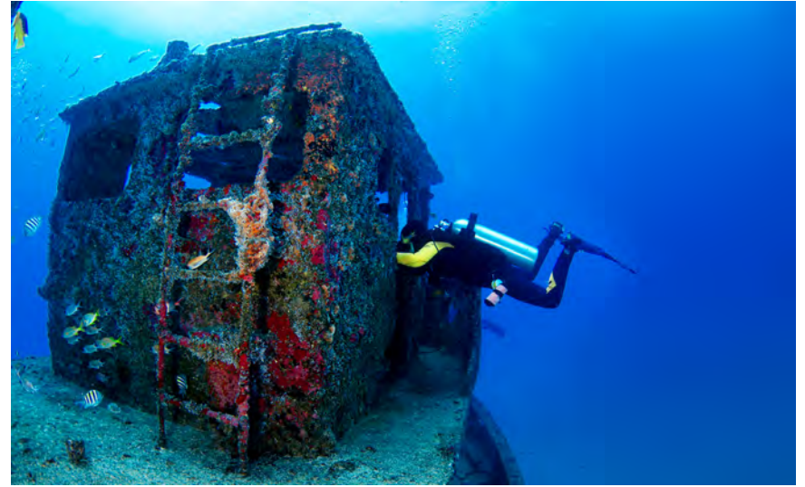
In 2015, a Spanish company discovered treasure in a shipwreck like the one pictured. It was worth $17 billion in gold and silver!

Like Mel Fisher, some hunters focus on shipwrecks. The ocean floor is littered with thousands of sunken vessels. Some of them still carry gold, silver, and precious objects. Other treasure hunters search on land for lost stashes. Perhaps a criminal buried stolen money and never came back for it.